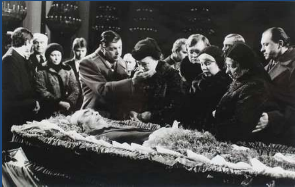
Funeral of Leonid Illyich Brezhnev (15 Nov 1982) President, USSR (1964 – 1982)